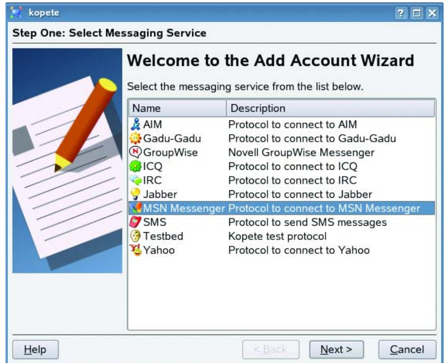
Figure 1. The Add Account Wizard

In our on-line worlds, most of us have buddy networks that span the globe and probably include all popular services and operating systems. So it is inevitable that ultimately we will have to communicate with loved ones who