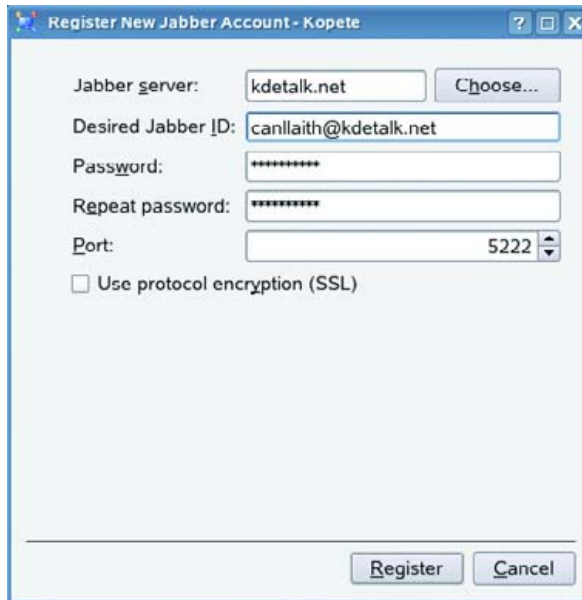
Figure 2. Registering a Jabber ID

Creating a Jabber account is usually done within your Jabber client. In the Accounts configuration dialog, select New... and choose Jabber from